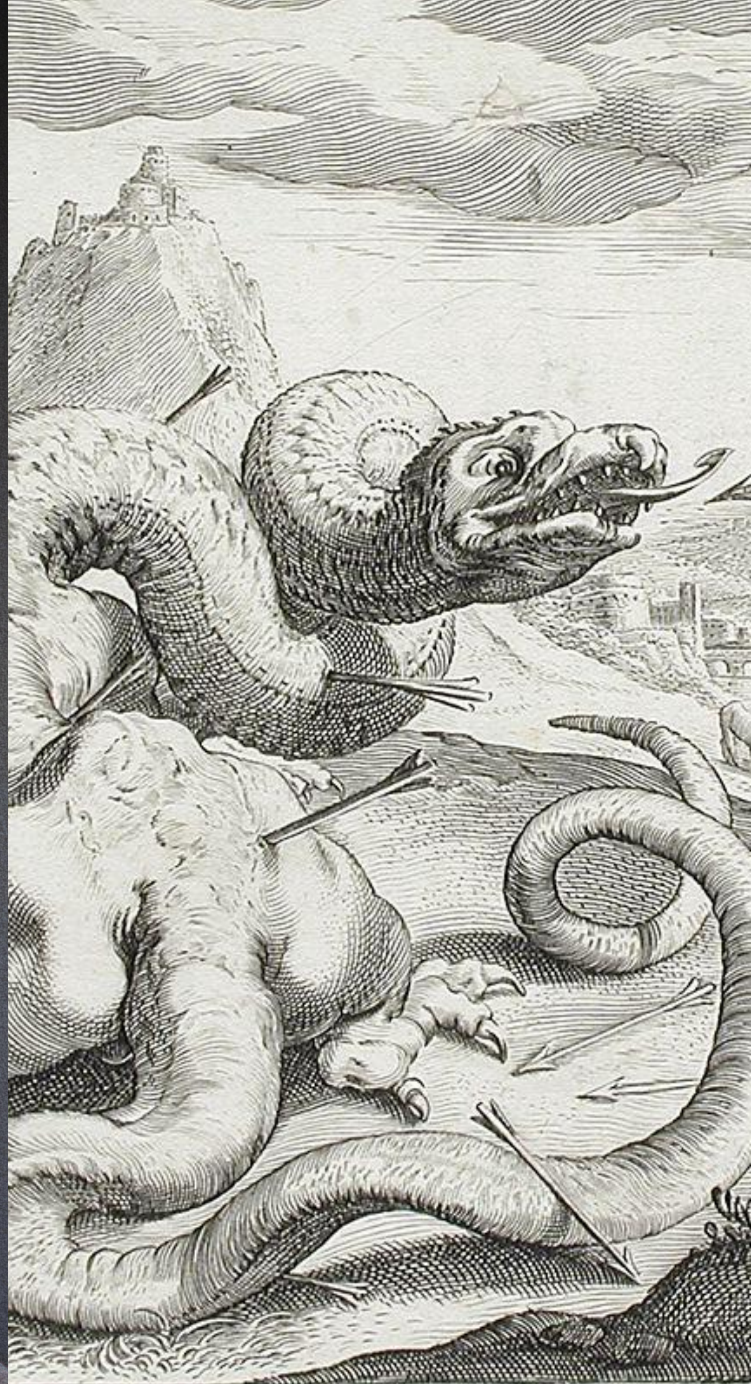
TRIX HAC AVREA MONSTRAT. Agora