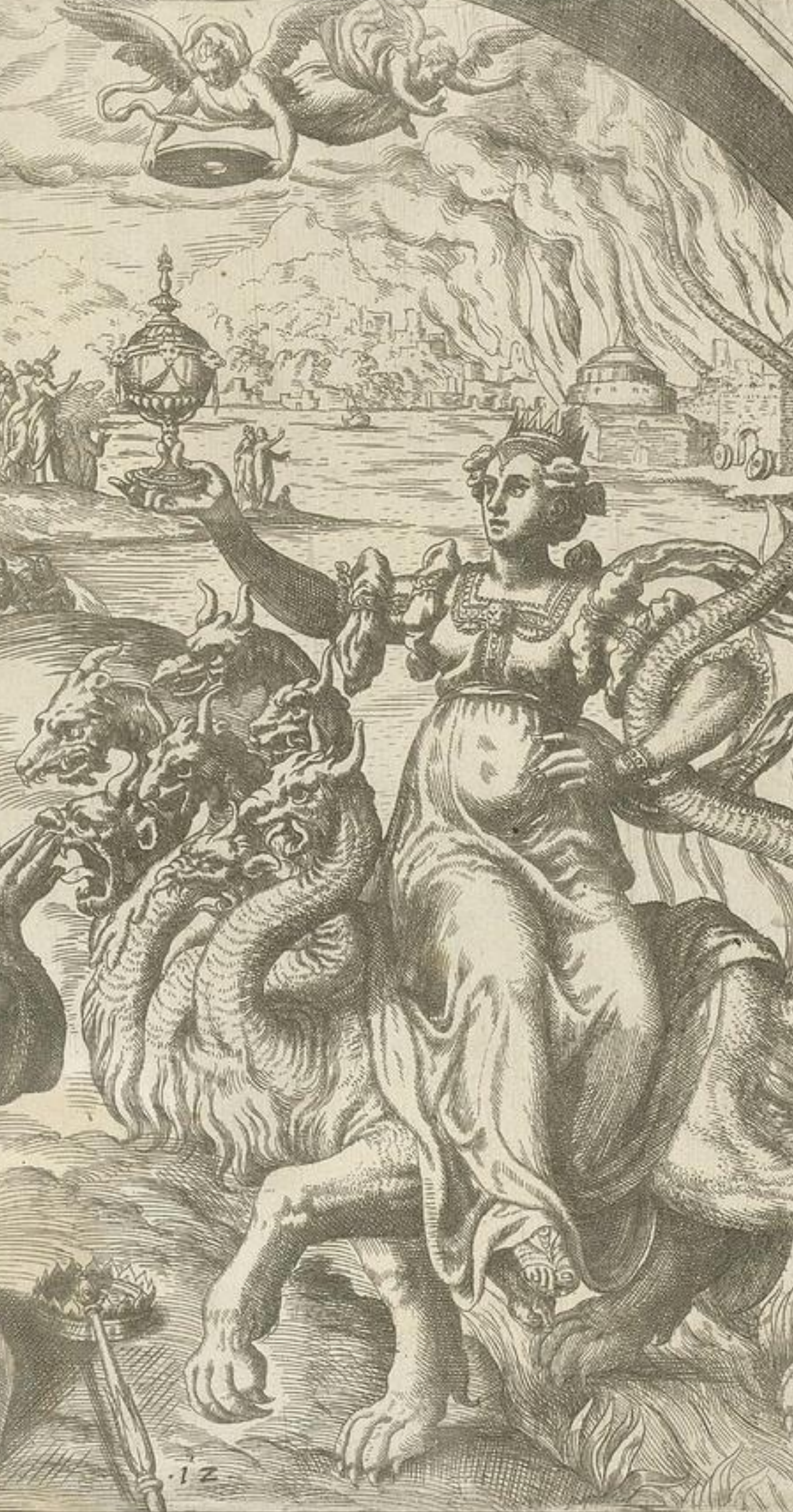
TRIX HAC AVREA MONSTRAT. Agora