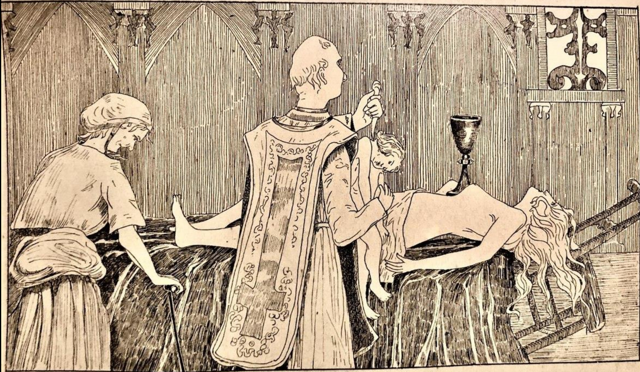
LA MESSE NOIRE DE L'ABBÉ GUIBOURG (FIN DU XVII e SIÈCLE) (Enfant égorgé; l'autel c'est la Montespan)