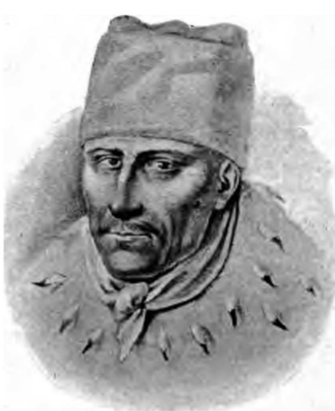
Jacob Frank b. 1726